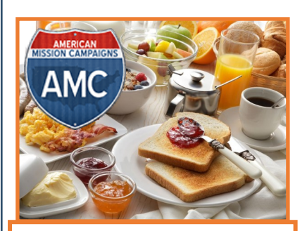
An AMC Breakfast with Austin Fowler 5/11/24 9:00 AM